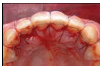
779 Palatal Gingiva