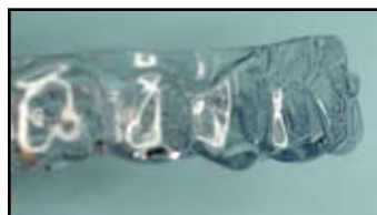
773 Third Molar Anchorage